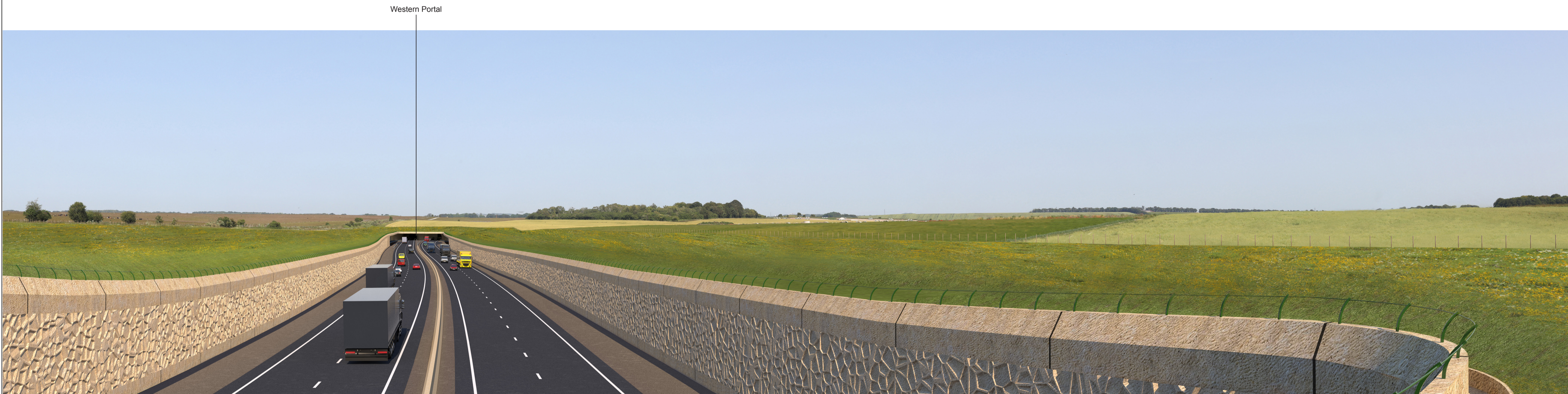
PROPOSED (SUMMER YEAR 15)